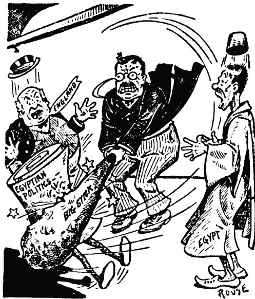
THE BIG STICK IN USE AGAIN From the Press (Grand Rapids)

Optional Bonus Material: Not Discussed in Class.....Not Graded